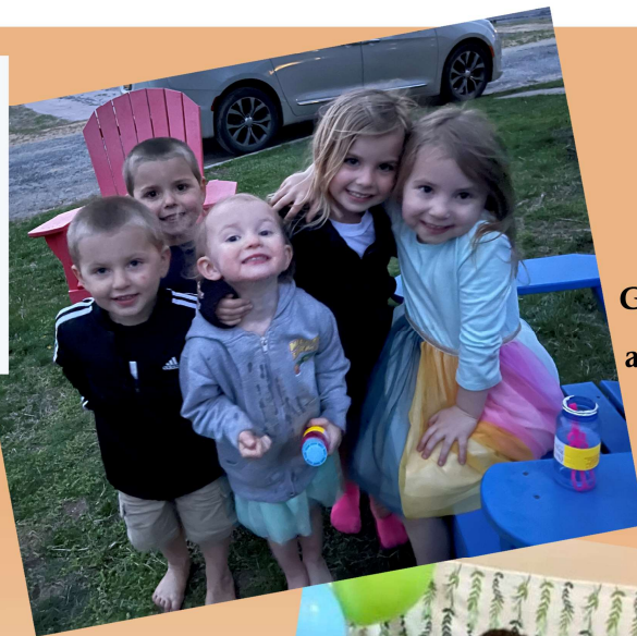
Great Time with Grand-Nieces and Nephews in Maryland!