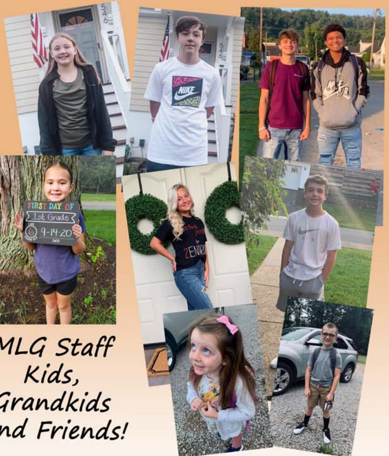
MLG Staff Kids, Grandkids and Friends!