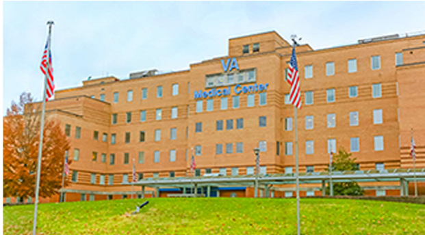
Wrongful Deaths at Clarksburg VA Page 1

Check out our blog at MileyLegalBlog.com