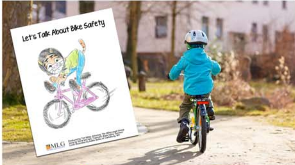
Childhood Safety and a FREE Coloring Book Page 1

Check out our blog at MileyLegalBlog.com