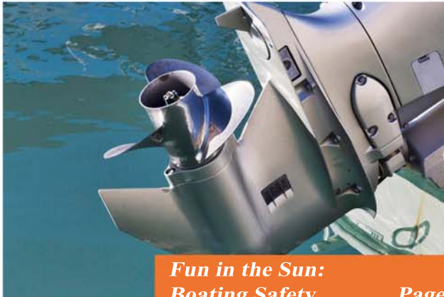
Fun in the Sun: Boating Safety Page 1

Give this newsletter to a friend. They will thank you for it and so will I.