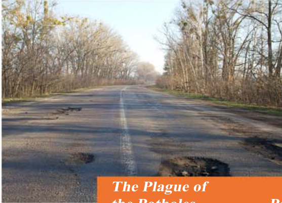
The Plague of the Potholes Page 1

Check out our blog at MileyLegalBlog.com