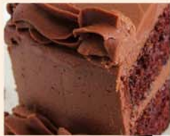
One Bowl Chocolate Cake Recipe Page 3