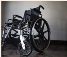
September's Cases of Interest Page 3