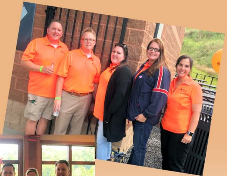
MLG at a WV Black Bears Game