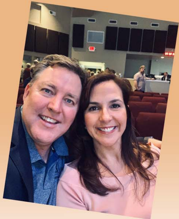
Thank you to Horizons Church for the Vow Renewal Ceremony!