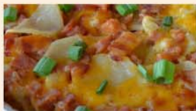
Scalloped Potatoes with Ham and Bacon Page 3