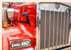
April Cases of Interest Page 3